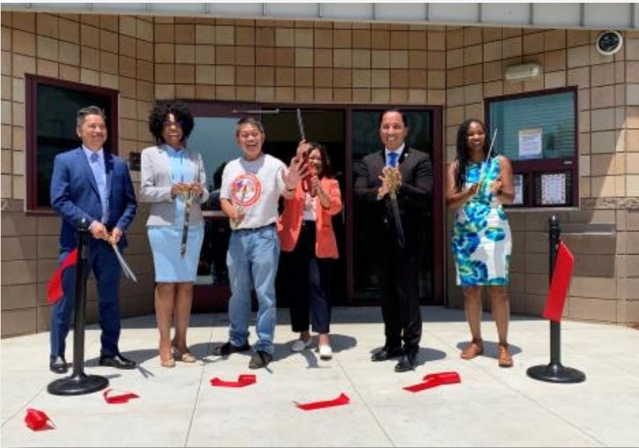
Bay Terraces Community Center Park & Rec Department