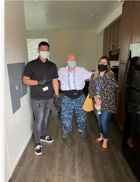
Homelessness Services and Programs Housing Navigation