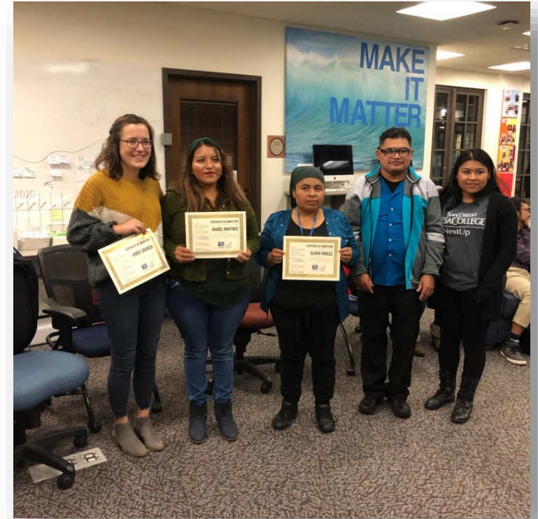
Access Microenterprise Program