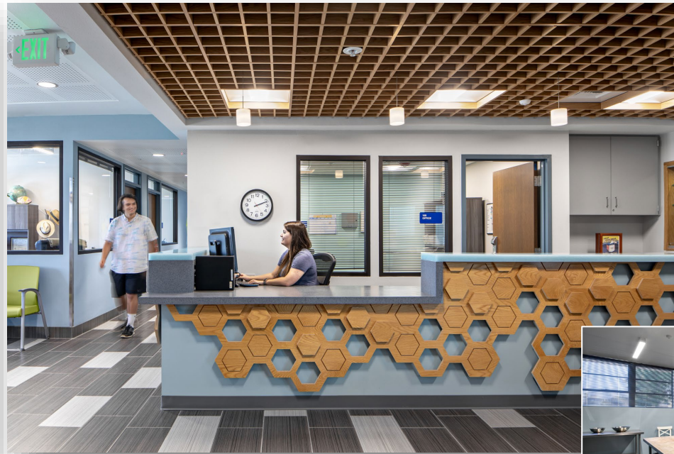
Park de la Cruz Community Center Park & Rec Department