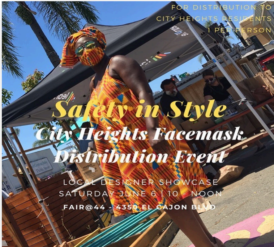
Low-Income Entrepreneurship Assistance Program Supported by International Rescue Committee