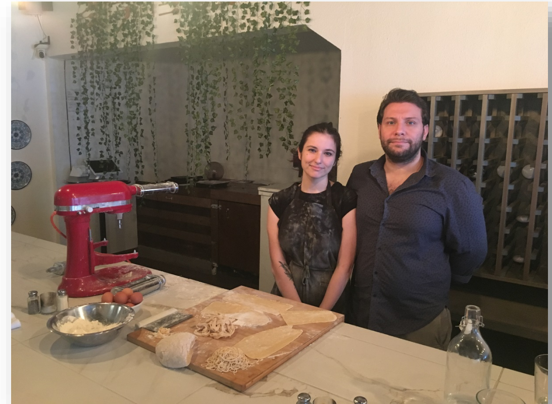
Mattarello Cooking Lab Supported by Accessity (formerly Accion San Diego)