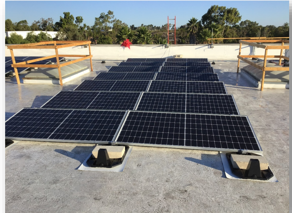
Arc of San Diego North Shores Solar Project