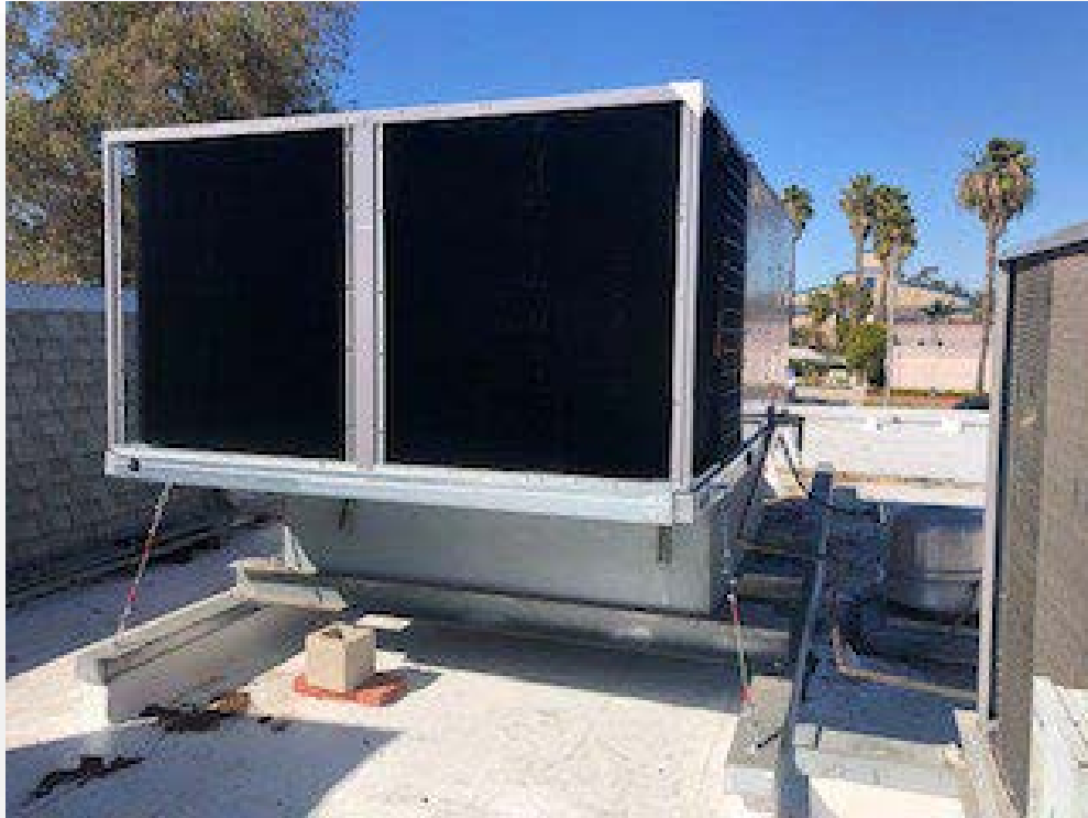
San Diego American Indian Health Center Health Center Improvement and ADA Upgrades