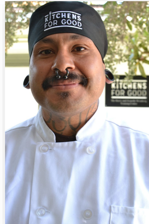
Project LAUNCH Kitchens for Good