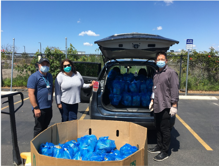
Bayside Community Center Bayside Social Services