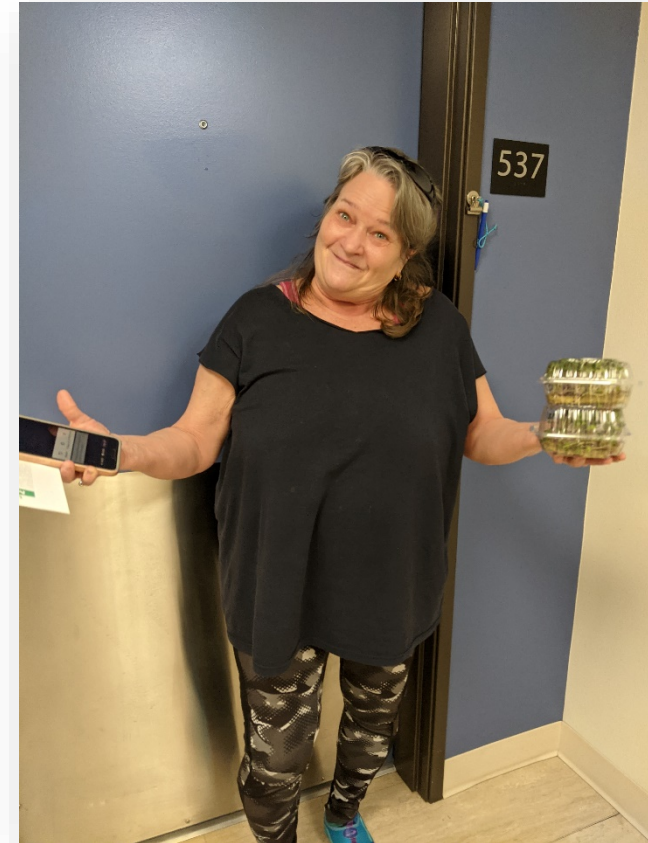
Urban Growth Urban Growth CSA