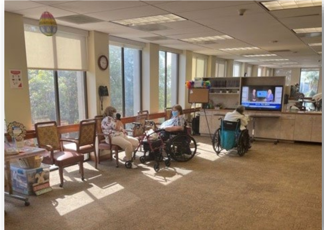
St. Paul's PACE Reasner Improvements